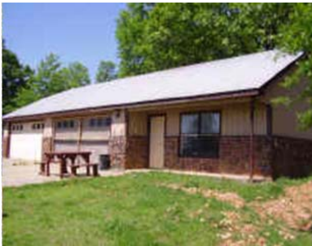
Ranch Manager's Home