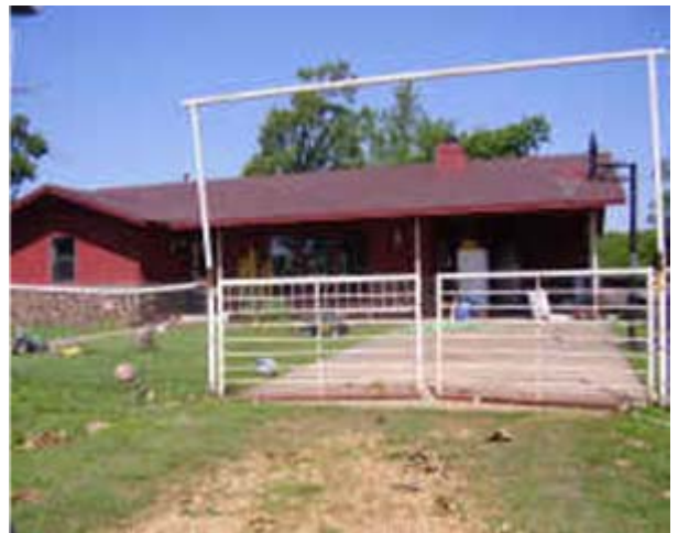
4 Car Garage with Shop & Office