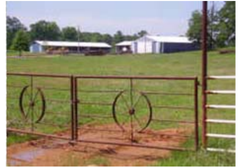
Home, Garage, Shop and Equipment Shed