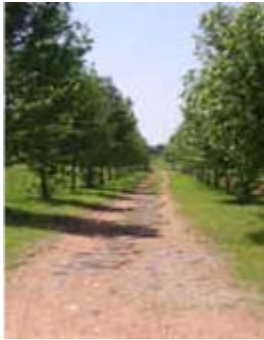
Entrance with Main House