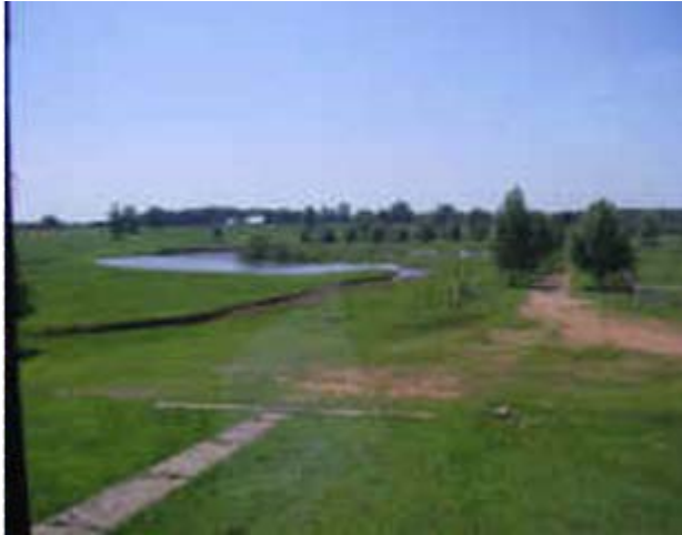
View from House