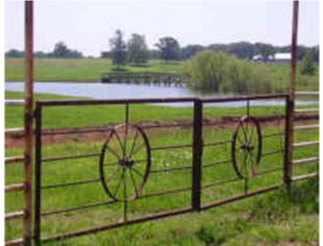
View from Lane